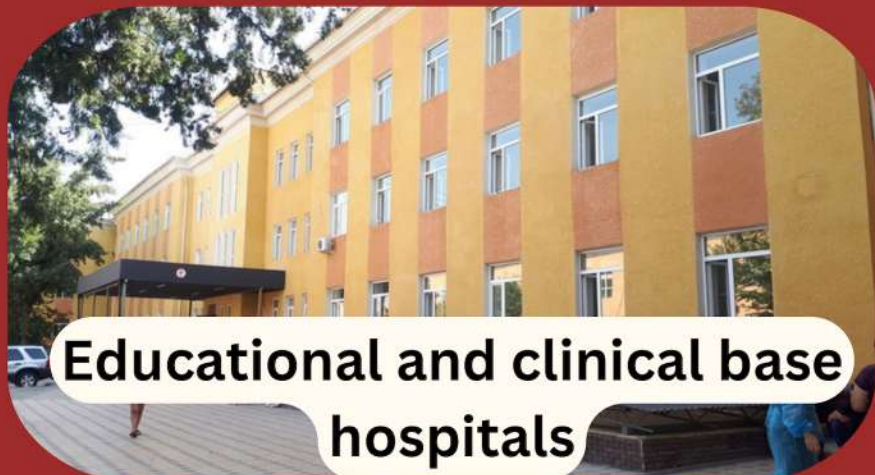
Educational and clinical base hospitals